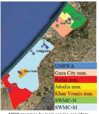
MSW coverage by main service providers (authors' elaboration).