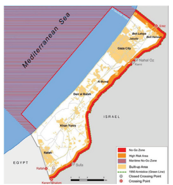
Land and maritime no-go zone in Gaza Strip (United Nations OCHA, 2011. Easing the Blockade)