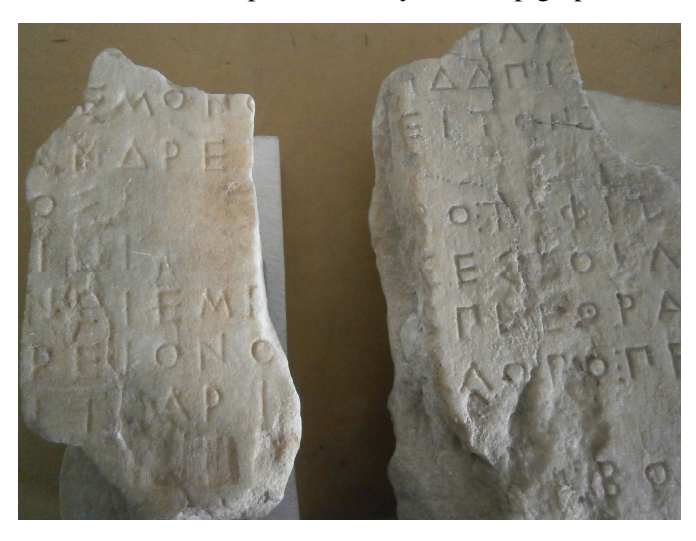
Fig. 4 = IG I^3 219 and 420 side by side.