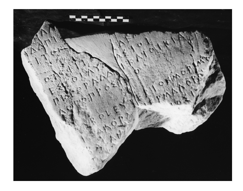
Fig. 3 = IG I^3 420 . EM 6659.