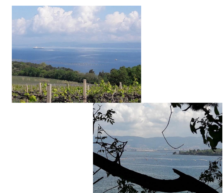
Figure 2 . Views from the vineyards of the Debeli Rtič landscape park: the lined-up floaters of the maricultures in the Slovenian waters with the Italian city of Trieste on the opposite coast (second picture).